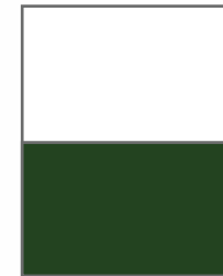
1/2 Page with Bleed

Ad size: 8.625" x 5.625" Safe [Live] Area: 7.875" x 4.875"